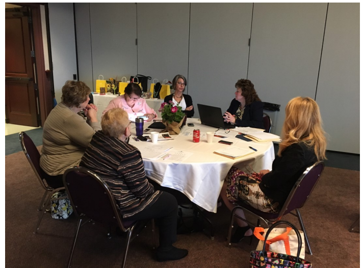
AMES Fund meeting prior to the event—selecting winners!