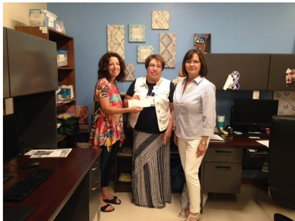
Lawrence County Medical Society Auxiliary—supporting children with funds from their nut sale!