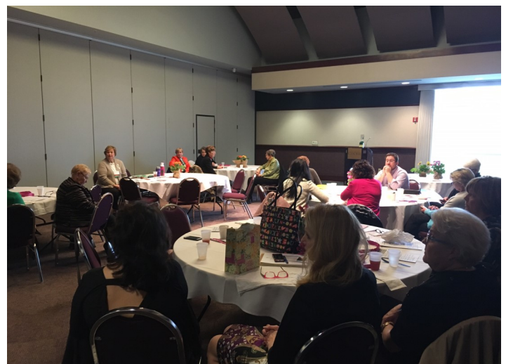
Lively discussions about membership, county activities, AMAA's opioid abuse initiative and marketing our Alliance!