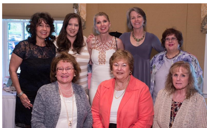
Guests and models, all looking GOOD at the Dauphin County Alliance's FABULOUS Spring Fashion show, which raises funds to support area programs and charities!

Dauphin County is also hosting the 5th district luncheon this year on Tuesday, November 14, 2017 at 11:30 a.m. at the West Shore Country Club in Camp Hill, PA. The cost per person is $30.00 and includes soup, a hot chicken entrée and yummy dessert.