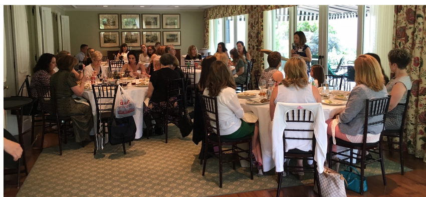
Northampton County Alliance Spring Luncheon, at which they presented checks to numerous county programs and charities which support community health and welfare with funds raised during Casino Night!