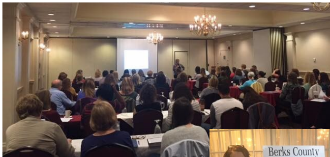
Berks County's long running and popular speaker series—this year, focused on adolescent and teen stress and anxiety. They always have a GREAT turnout of education and community leaders.