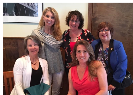
The Franklin County Alliance hosted the Franklin County Heroin Overdose Task Force to learn about how to make the residents of Franklin and Fulton counties safer. Several members from other counties made the trip to get educated.