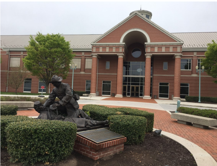
National Civil War Museum, Harrisburg. Magnificent venue!